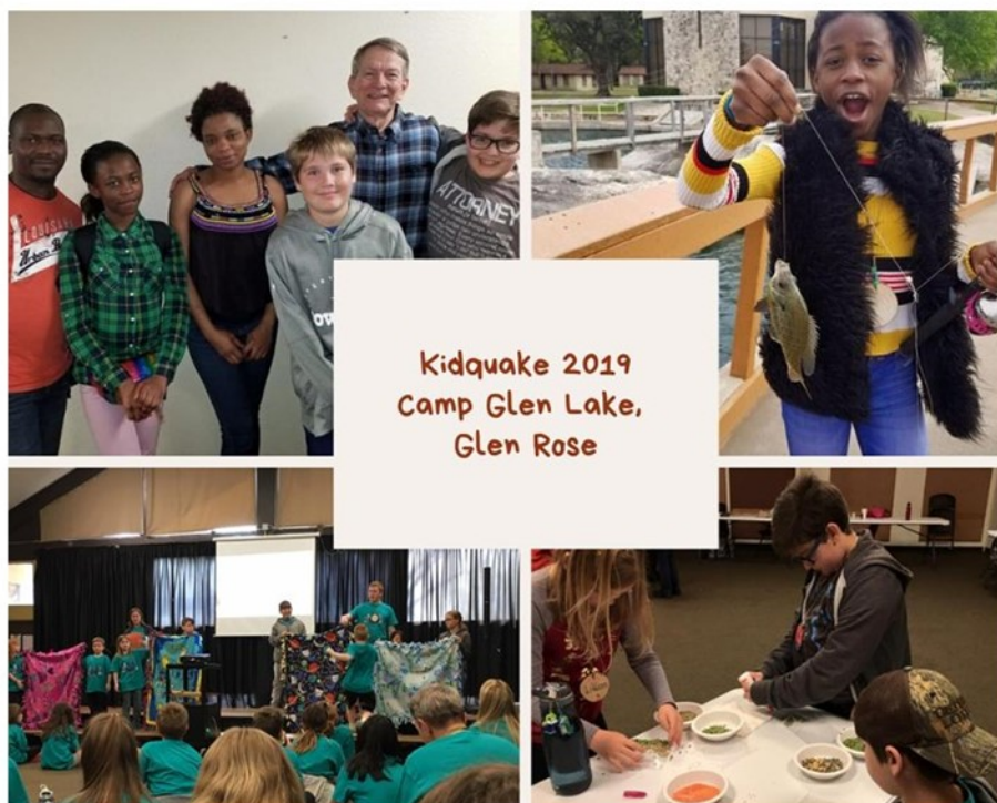
Kidquake 2019 Camp Glen Lake, Glen Rose

Once again, we give thanks for Emmanuel's support that made possible for two sponsors and three of our children to attend Grace Presbytery's Kidquake camp in Glen Rose in March. We had a wonderful time learning through Bible study, serving through a mission project, worshiping and enjoying camp activities.